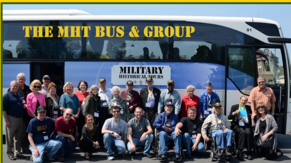
THE MHT BUS & GROUP