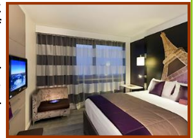
No sleeping in foxholes!

Bayeux —This Cathedral, also known as Cathedral of Our Lady of Bayeux is a Roman Catholic Church located in Normandy. A national monument and was the original home of the Bayeux Tapestry. The cathedral is in the Norman-Romanesque architectural tradition.