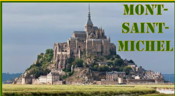
MONT- SAINT- MICHEL